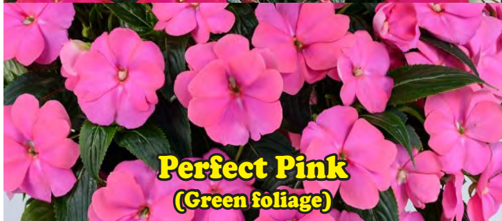
Perfect Pink (Green foliage)