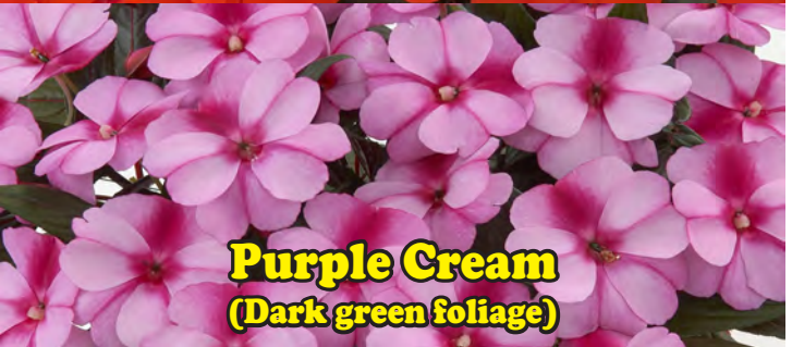
Purple Cream (Dark green foliage)