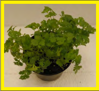
Cilantro Slow Bolting