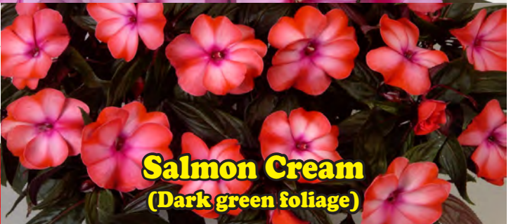
Salmon Cream (Dark green foliage)