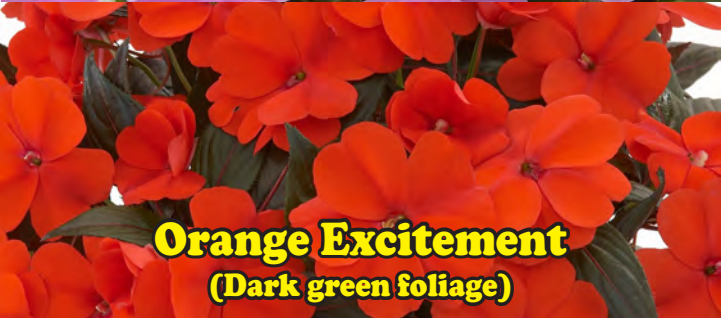
Orange Excitement (Dark green foliage)