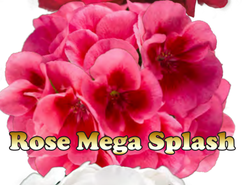
Rose Mega Splash