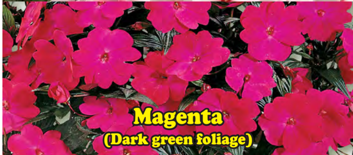
Magenta (Dark green foliage)