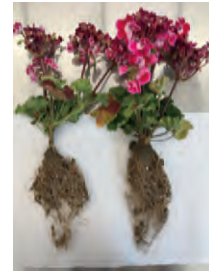
Weekly fertilizer of 3lb/A. Competitor on Left, Gravity® S on Right