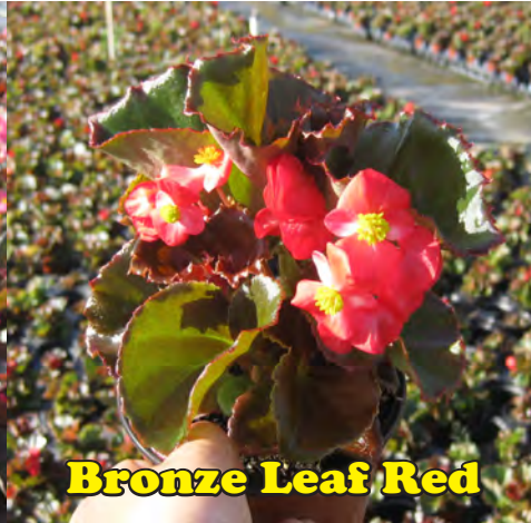
Bronze Leaf Red