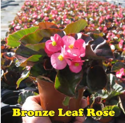
Bronze Leaf Rose

The Eureka Series boast big, colorful blooms and bronze foliage. Eureka is the best field performing, compact Begonia on the market. Very strong branching and tolerant to adverse conditions makes this the best choice for landscaping. Vigorous with a bushy habit the bronze foliage allows a greater exposure to direct sunlight. Grows in Sun to Partial Shade 9-12" tall and 7-9" wide.