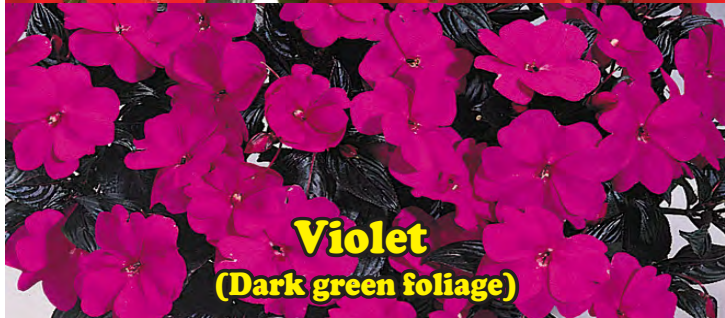
Violet (Dark green foliage)