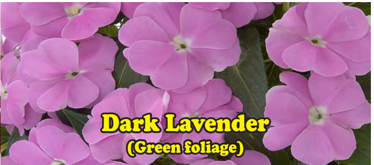
Dark Lavender (Green foliage)