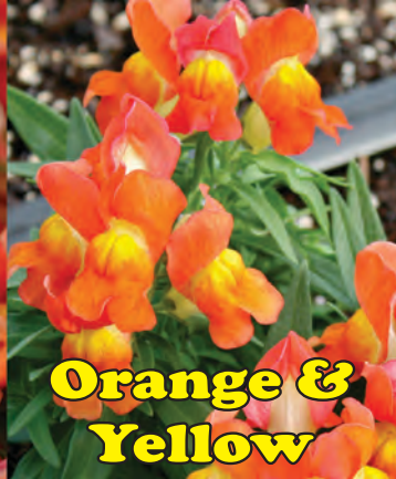
Orange & Yellow