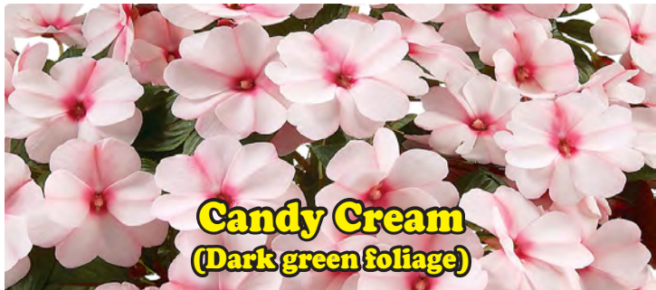
Candy Cream (Dark green foliage)

Harmony New Guinea Impatiens are very well branched with uniform compact growth. Harmony's have large round flowers with excellent garden performance. We recommend the Harmony Series to be used in partial shade. Grows 10-18" tall and 12-16" wide. For full sun we recommend using the Sunpatiens.