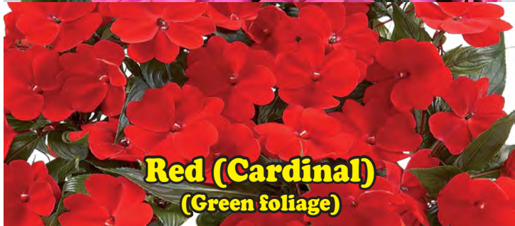
Red (Cardinal) (Green foliage)