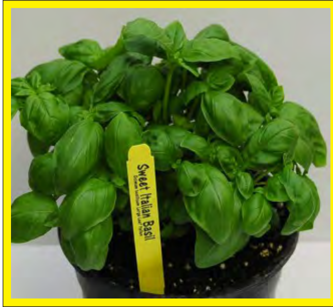
Basil Sweet Italian