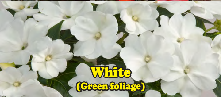
White (Green foliage)