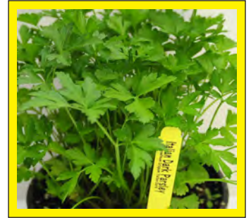
Parsley Italian Dark