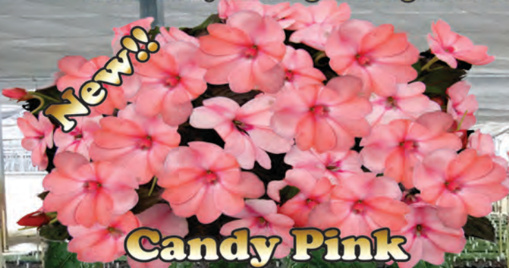
Candy Pink (Replaces Blush pink)

Sunpatiens are a revolutionary new hybrid impatiens that thrives in sun and takes the heat. Sunpatiens are the result of an intense breeding program that has spanned many years and has been tested the world over. Strong weather tolerant plants that hold up well to wind and rain while thicker petals and foliage are less prone to disease. Grows 14-36" tall and wide in the garden. Make sure you have good irrigation. Sunpatiens are Downey Mildew resistant.