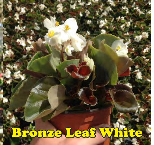
Bronze Leaf White