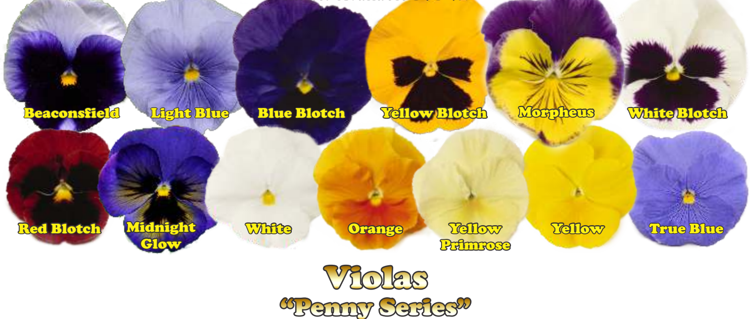
Viola x hybrid

Pansies are the cold weather plant of choice for late fall, winter and early spring color. They are exceptionally hardy and will thrive in the cool southern winter months. These pansies have large, thick-petaled, 3.5-in. flowers. Matrix makes high-impact landscapes and Frost tolerant and low maintenance. Grow up to 8" in height and 8 - 10" in width. Requires sun to partial shade. Available 12-1-20.