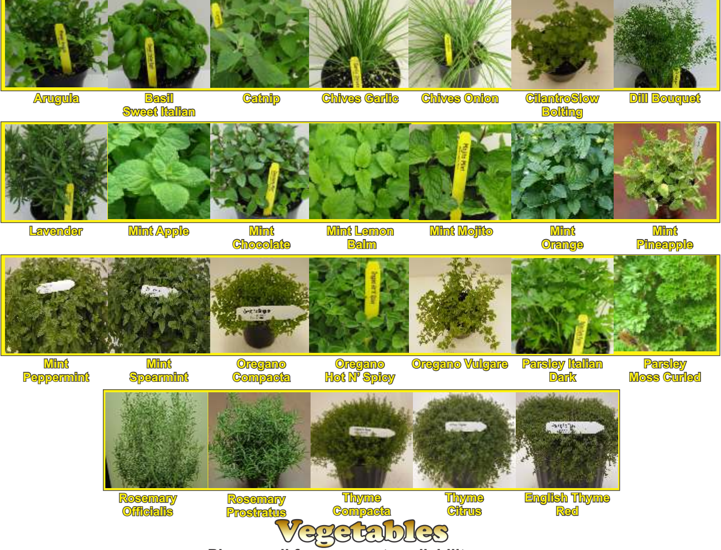
Please call for a current availability. Please note that other varieties may be available that are not shown here.